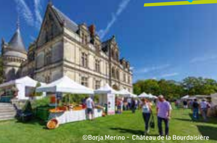
Château de la Bourdaisière

Head towards Parc Honoré de Balzac island, located in the heart of the city. A place to relax and connect with nature, here you can take in the view of the Cher and the vines planted in 2015.